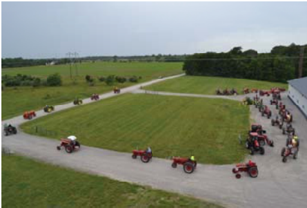
Tractors Drivers, Start your Engines!