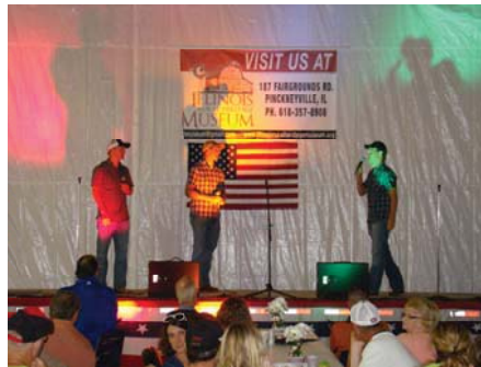
Peterson Farm Bros Performing!